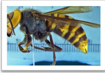
Asian giant hornet (AGH), or Vespa mandarinia

Monthly Articles in Paper and Seasonal Supplements / Static Displays - Indirect Hort-2000 per article, 7 articles per year = 14,000 people.