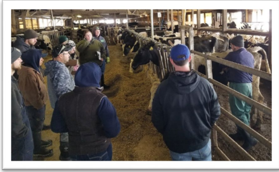
Herd Manager Training

others looking to purchase whole herds to expand their DFA base.