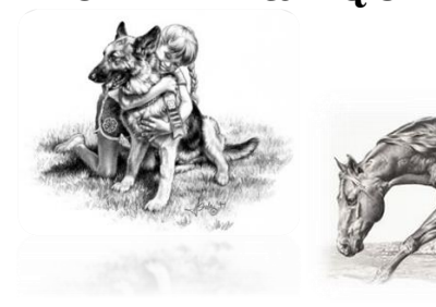
4-H & pinterest clipartsources

When/Where: This Saturday workshop is held every May on campus at Morrison Hall for 4-H members interested in learning more about their favorite livestock, companion or pet animal species; emphasis on different species groupings and activities varies annually.